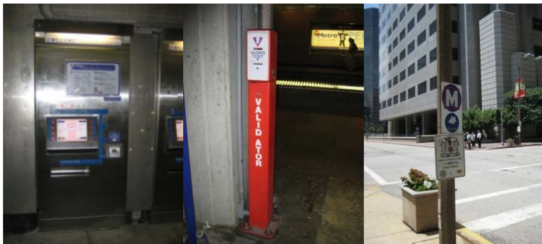
MetroLink Ticket Terminal

Follow signs at the airport to Metrolink Station (there is one station at each terminal of the airport). Purchase a ticket and validate ticket at a validation machine (see middle picture below) before getting on the Metrolink. Take the Metrolink (there is only one line at the airport) to the 8 th and Pine Station (see map on next page).